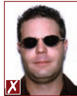
Dark tinted lenses