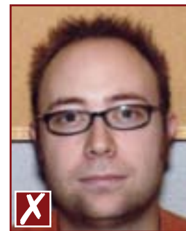
Object in background