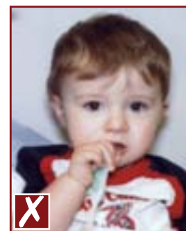
Object in picture