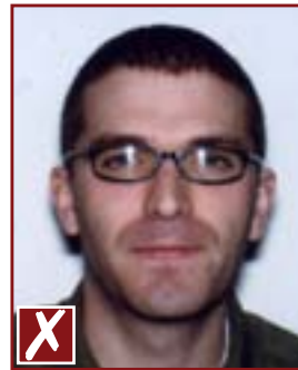
Reflection on glasses