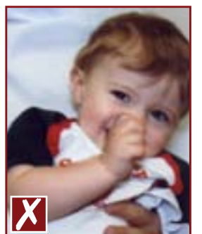
Hands in picture