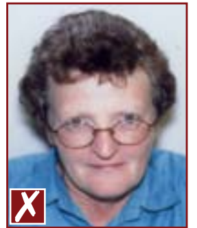
Frames covering eyes