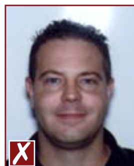
Reflection on face